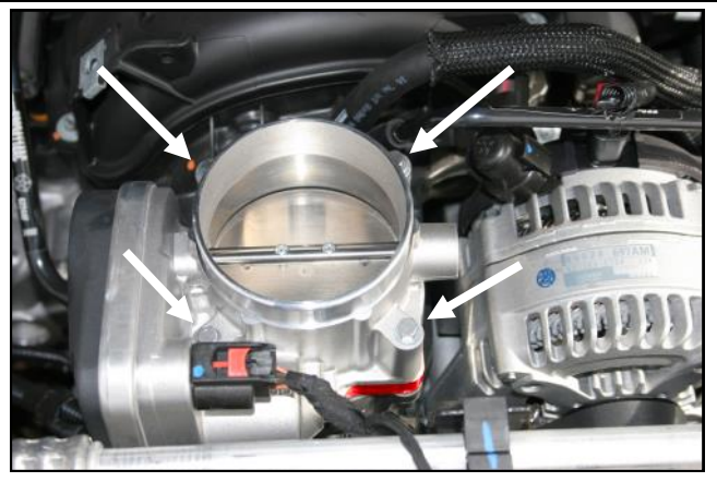
5. Reinstall the throttlebody on top of the Poweraid Spacer using the four bolts and the washers that were selected in step 3. Tighten the bolts evenly, in an X pattern, to the vehicle manufacturers specifications.