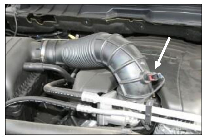
6. Reinstall the engine cover and intake tube in the reverse order that they were removed. Make sure to reconnect the temperature sensor.